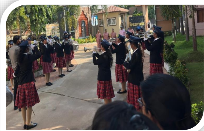
Sales Day - 20.12.2024