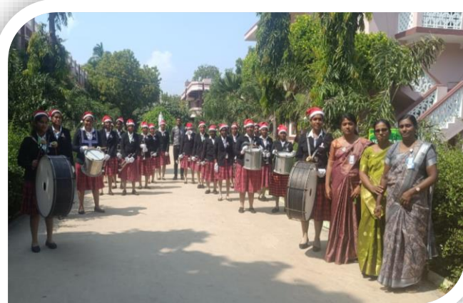
Christmas Day – 21.12.2024